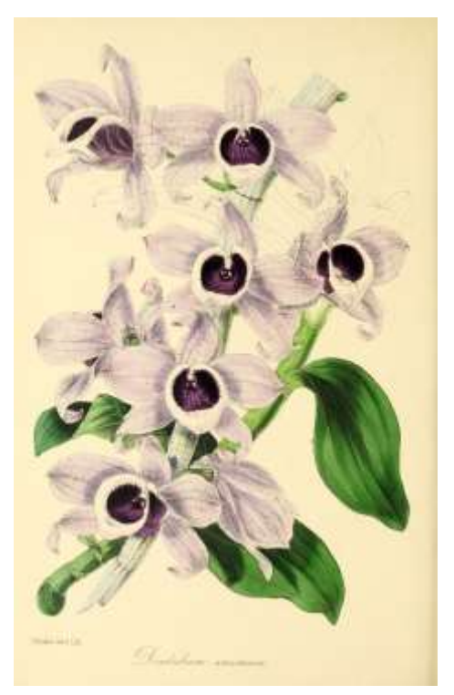
The first drawing of Den. anosmum (Paxton's Magazine of Botany in1849)

Messrs. Loddiges imported this handsome plant from the Philippine Islands into England in 1840. It was first described in the literature, and hence named, by John Lindley in 1845 when he wrote," This is a Philippine plant, which has lately flowered with Messrs. Loddiges. Its appearance is very much that of D. macrophyllum, but, 1. its flowers are scentless, and have not the strong odour of rhubarb; ; 2. they are smaller; 3. all the divisions of the flower are shorter, broader, and even, instead of being undulating."viii Joseph Paxton also made reference to its scent, or perceived lack thereof, when in 1846 he wrote, when comparing it to that of D. macrophyllum , that it was "free from . . . the powerful and somewhat unpleasant rhubarb scent."ix So considering it bloomed in England and it was being compared to an orchid that had a "powerful and somewhat unpleasant rhubarb scent", Lindley obviously concluded it was scentless, giving it the species name anosmum.x